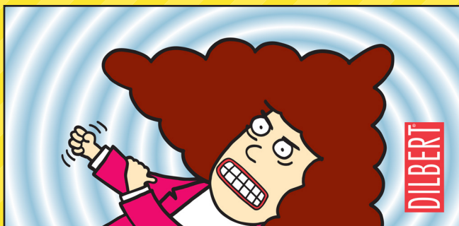
ALICE - Female engineer who is habitually over-worked and handles idiocy with her fist.