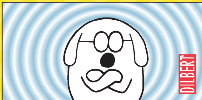
DOGBERT - His not-so-secret ambition is to conquer the world and enslave all humans.