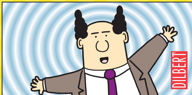
THE BOSS - His top priorities are the bottom line and looking good in front of his subordinates and superiors.