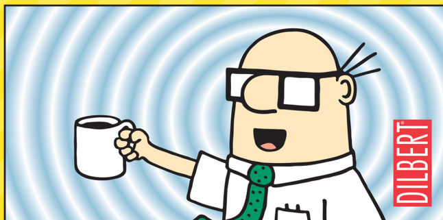
WALLY - Engineer and cynical employee who has no sense of company loyalty.

DILBERT® means business. Anybody who works in an office or deals with bureaucracy relates to Dilbert's plight. Created by Scott Adams, DILBERT® addresses issues ranging from office-envy/challenges to new technology and the mayhem they produce. Create your own office-envy and "lighten up" the workplace with DILBERT® Sky-Scapes®!