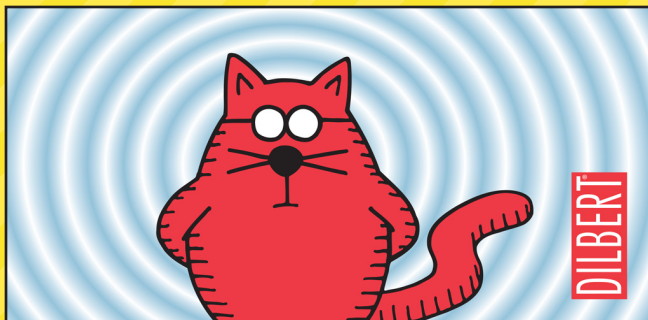
CATBERT - The evil Human Resources Director at Dilbert's company that mercilessly teases employees.