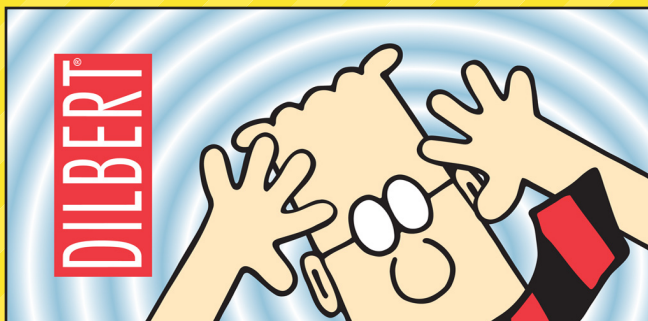
DILBERT - An engineer that loves technology for the sake of technology.